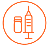
Clinical Trial Support