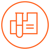
Bioassays for CMC Support