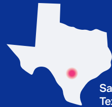
San Antonio, Texas

Clinical biomanufacturing for preclinical, clinical scale, and limited commercial-scale biologics.